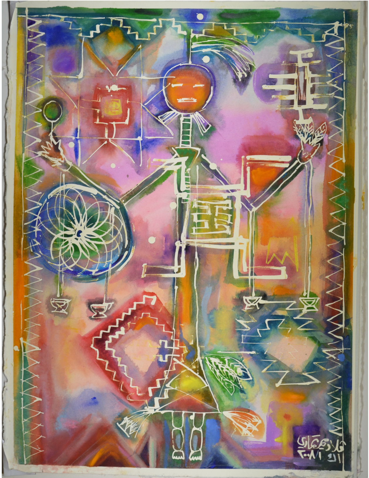
Curt Cacioppo: Monsterslayer, 2008, by Vladimir Tamari